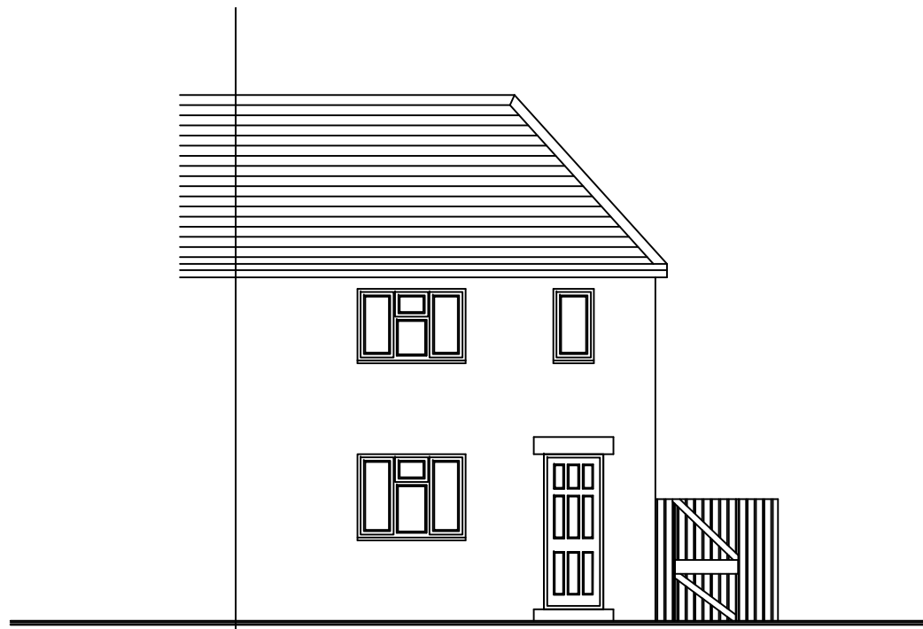
Front Elevation As Existing and Proposal